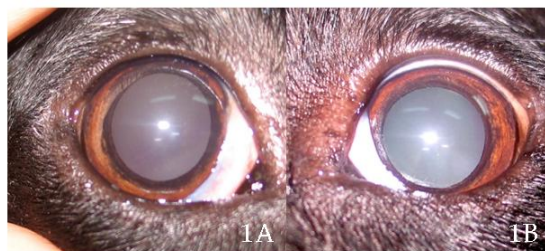
Figure 1 Ophthalmic appearance of the right (1A) and the left (1B) eye.

Ophthalmic examinations revealed no neuro-ophthalmic responses including menace response, dazzle reflex and pupillary light response on both eyes (Fig 1). The dog failed on maze test under light and dark conditions. Levels of STT 1 and IOP were within normal limits. Ocular surface appeared fine. Lenses were clear.