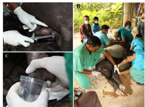
Figure 1 Semen collection by electroejaculation in a Malayan tapir (A-C). A) Testes were measured using a Vernier caliper prior to semen collection; B) A rectal probe with three longitudinal electrodes was inserted into the rectum and electrical stimuli applied. Another person assisting with the collection, directed the penis into a sterile polypropylene specimen cup; and C) Ejaculates appeared milky white.

Testicular assessment: Tapir testes were examined for testicular size and tonicity (Fig 1). The testes were measured for length (L), width (W) and height (H) using the Vernier caliper (Mitutoyo, Japan). These values were then used to calculate the testicular volume using the formula: Volume (cm 3 ) = 0.5233 x LxWxH (Howard et al., 1983; Love, 1992; and Pukazhenthhi et al., 2011).