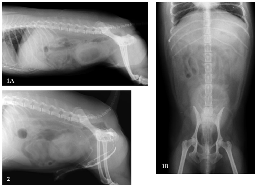
Figure 1A, B Right lateral and ventrodorsal abdominal radiographs

Plain right lateral and ventrodorsal views of abdominal radiographs were taken to evaluate the urinary tract abnormalities and positive contrast urethrography was performed to investigate the cause of urethral obstruction.