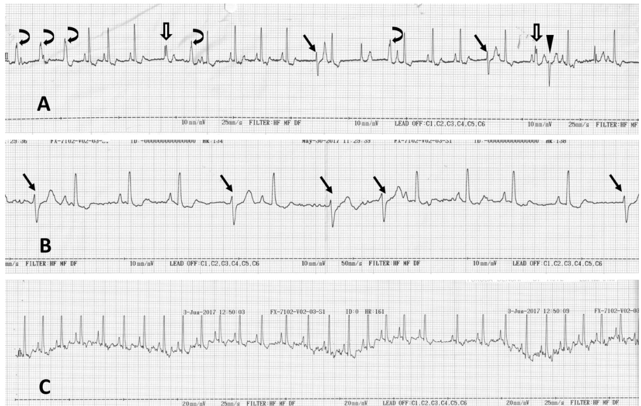
Figure 1A and 1B - Sinus rhythm with ventricular ectopy and some fusion beats Figure 1 C - Sinus arrhythmia

The tracings in figure 1A and 1B had paper speed of 25 and 50 mm/second, respectively. In Figure 1A, many shapes of ECG waveforms that have both left and right axis deviation are seen. The basal intrinsic sinus rhythms could be seen with the rate of approximately 125 to 150 beats per minute. However, there inconsistent R- R interval suggesting that the respiratory sinus arrhythmia occurs. Please notice two different kinds of ECG waveforms with right axis deviation (dark straight arrows and triangle). These waveforms are originated in different locations below the atrioventricular junction inside the ventricle since the preceding p-wave was not seen. The emerging ventricular waveforms were usually presenting when the rate of sinus was slow down during respiratory cycle. Thus, the accelerated idioventricular rhythm was accomplished. Other bizarre waveforms with wide and upward reflections (curve arrows and opened arrows) were seen without p-wave. Thus, the delayed depolarization of left part of ventricle in which impulses do not travelling along the left bundle branch was suggested. Some ECG waveforms have characteristic in between two different shapes. The last opened arrow ECG complex show the combined shape of sinus and ectopic waveform. Thus, the electrical signal can be fused to make another different waveform called the "fusion beat". The severity of ECG abnormalities will depend upon whether the