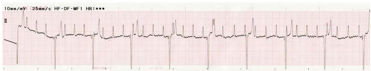
Figure 1 ECG tracing recorded during the first admission

II ECG was shown in Figure 1. The thoracic radiograph was re-performed and the results showed whole heart enlargement with an enlarged pulmonary vessels. Dog also had hepatomegaly and mild splenomegaly. No evidence of pulmonary edema was found. From echocardiography showed the both cardiac chambers enlargement especially the right side. The thickening and insufficiency of both tricuspid and mitral valves were found with LA/Ao = 1.79 . Fractional shortening was 44 – 64%. The main pulmonary pressures were approximately 27 mmHg. The caudal vena cava distention was also observed. Abdominal radiograph showed cholecystitis, mild pathological changes at the body of pancreas, mild to moderate BPH and sand calculi packed at prostatic urethra. The positive inotrope, pimobendan and bronchodilator were added along with angiotensin converting enzyme inhibitor and diuretic. Antibiotic was prescribed to control infection. One week after medication dog was more alert with improved exercise tolerance and less coughing.