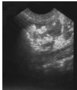
Figure 1 A sagittal ultrasonographic image of the left, cranial, abdominal mass in a two-year-old, female squirrel, in dorsal recumbency. A 2.6 by 3.4 -cm, well-defined mass, with smooth echogenic border, was located in the abdominal wall, just cranial to the left kidney position. There were several large hyperechoic areas within the hypoechoic center.

tissue density in the left cranial part of the abdomen. The abdominal organs were in normal position. At the second visit, five days later, the mass had become larger, about 4 cm in diameter, and hard in consistency. The squirrel was anorexia and had diarrhoea. Ultrasonography of this mass was performed to obtain more specific information.