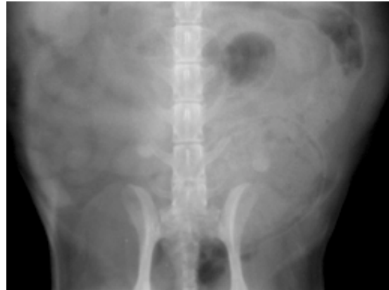
Figure 2 Ventro-dorsal position of the same dog.