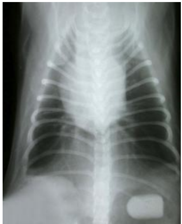
Figure 2 Ventro-dorsal position of the thorax of the same dog.