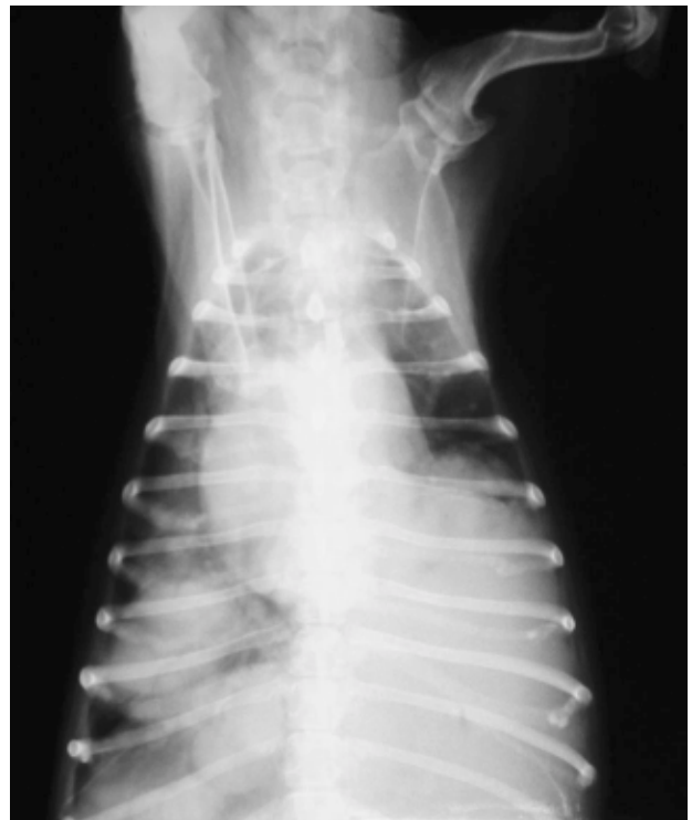
Figure 2 Ventro-dorsal position of the same dog.