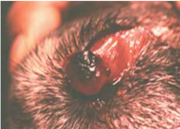
Figure 1 Hemangiosarcoma of the nictitating membrane. A solid, proliferative, dark red mass was located at the palpebral conjunctiva of the left nictitan in a 7 year-old Great Dane.