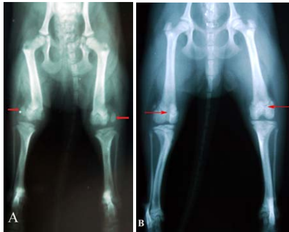
Figure 1. Ventrodorsal radiographs of both hindlimbs in the first dog: A: patella luxated laterally; B: patella stayed in the normal position 2 months after surgery (arrows).

taken while the patella was out of the trochlear sulcus in order to evaluate limb alignment (Figure 1). Skyline views of the stifle joint were made preoperatively and postoperatively to evaluate the depth and contour of the femoral trochlea (Figure 2). Radiographs of all dogs illustrated patellar luxation on the lateral site with either absent or convex trochlear sulcus.