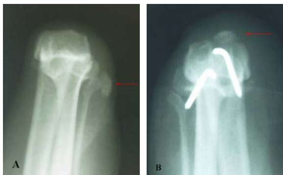
Figure 2. Skyline radiographic views of the left hindlimb (case 3) illustrated the patella luxated laterally (A) and in the trochlear sulcus after surgery (B) (arrows).

Physical examination and blood analysis were performed preoperatively. Acepromazine 0.02 mg/kg and morphine 0.5 mg/kg were administered as premedications. Fifteen-thirty minute after the premedication, anesthesia was induced with propofol to effect and maintained with isoflurane in 100% oxygen. Prophylactic cefazolin 25 mg/kg is administered intravenously.