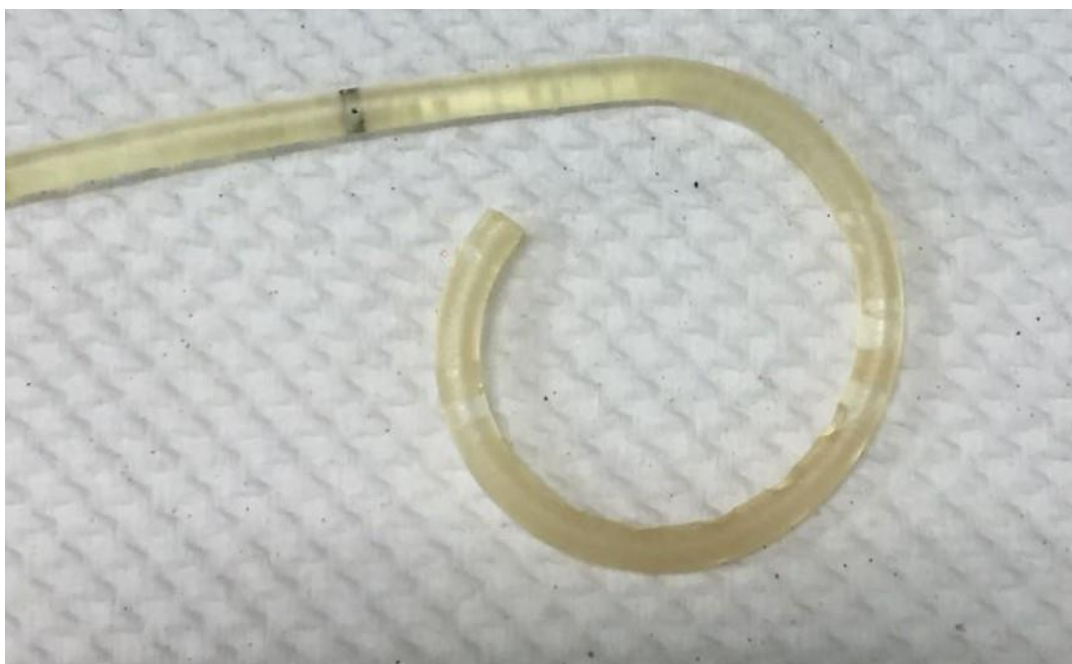
Figure 5 The lumen of the Cystofix® tube was blocked with white sandy uroliths.