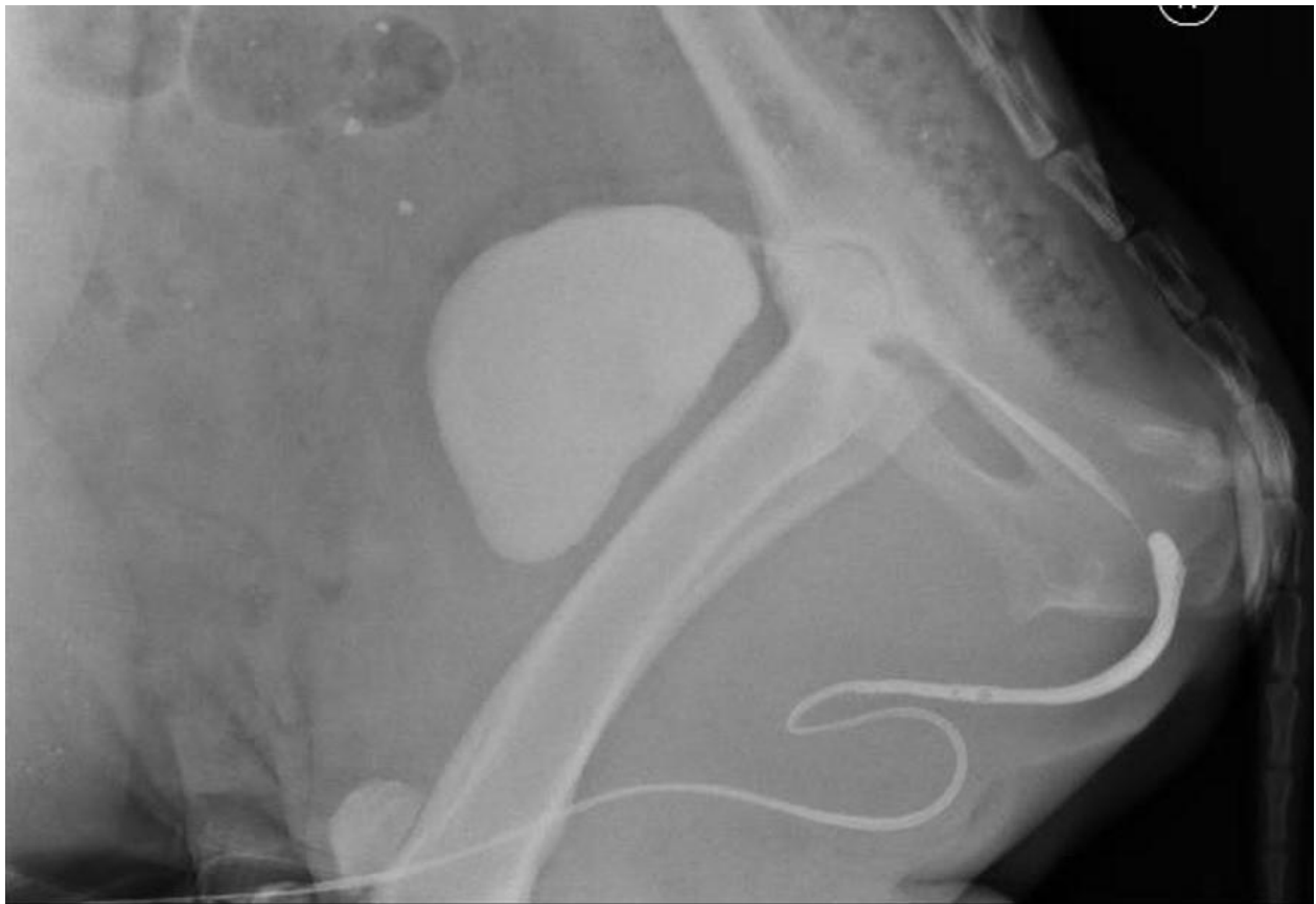
Figure 6 Cystourethrography and urethrography revealed the presence of urolith and stenotic urethra at the level of the pelvic inlet.

The urolith samples were sent to Minnesota Urolith Centre, under the Minnesota Urolith Programme, to diagnose the type of the urolith collected from the urethra and the bladder of the goat. The result showed that all uroliths were magnesium calcium phosphate apatite form.