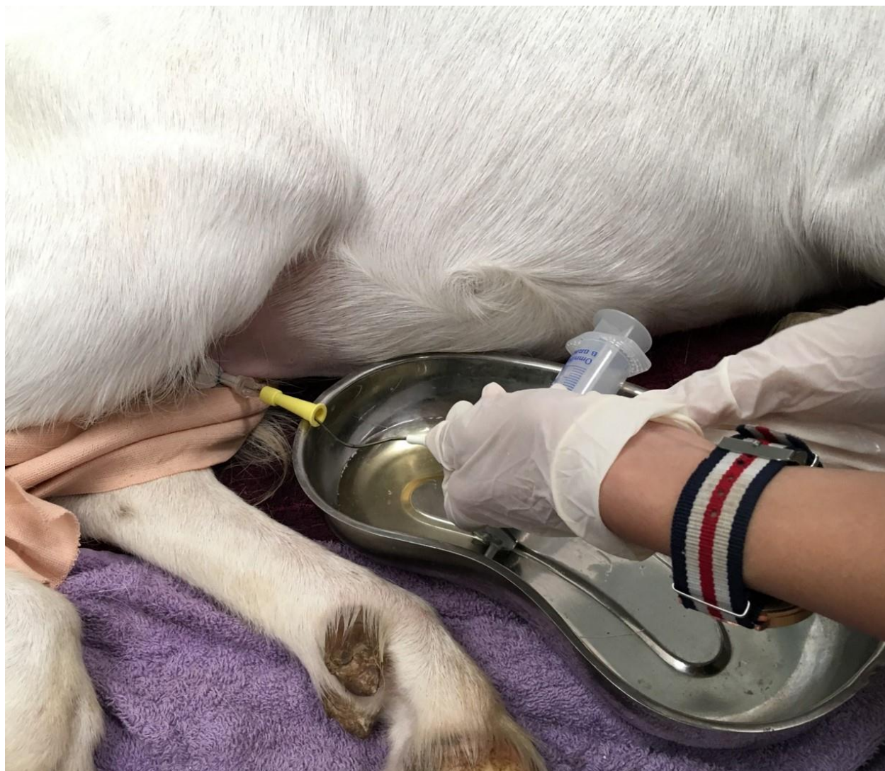
Figure 3 Periodic withdrawal of urine from the Cystofix® system in a goat.

The goat was given Lactated Ringer's solution at a replacement rate of 50 ml/kg/day. Enrofloxacin antibiotic (5 mg/kg, SID, Baytril 5%) was administered intravenously for five days. Flunixin meglumin (2.2 mg/kg, intramuscularly, once), tramadol (5 mg/kg, subcutaneously), and meloxicam (0.2 mg/kg, subcutaneously) as analgesic and anti-inflammatory were given twice a day for 3 days and once daily for another 3 days.