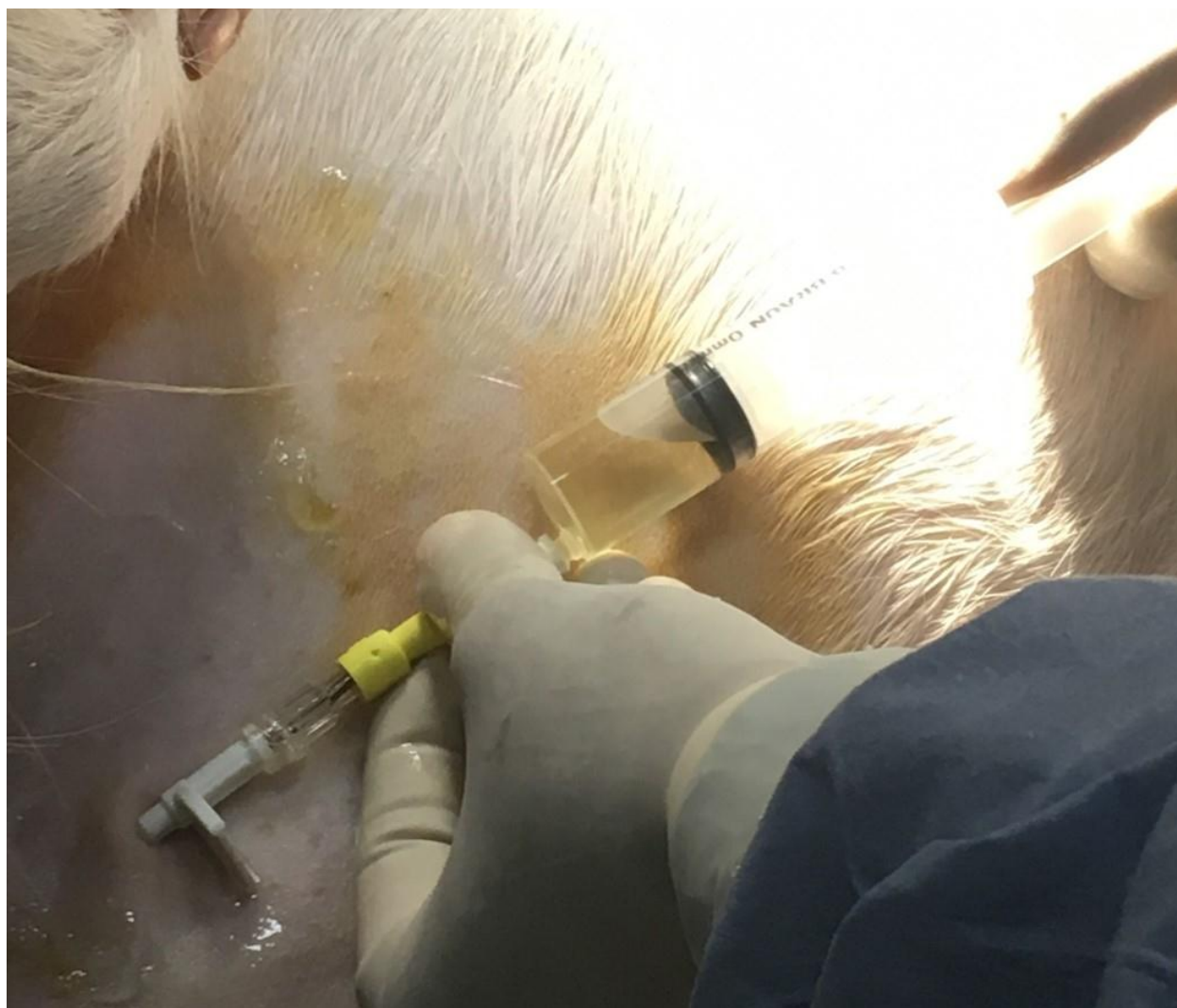
Figure 2 A percutaneous urinary bladder tube fixation using a Cystofix® system on the abdominal wall of the goat.

Progress: Upon insertion of the bladder catheter system and every hour of urine aspiration, the goat was finally urinating from the urethra. Urinalysis of the first day of hospitalisation revealed that the urine was acidic (pH5). The next day of hospitalisation showed an improvement on the goat with bright and alert, urinating from the urethra, and all parameters were improved. The swelling of the urethra at the incision site was markedly reduced with neutral pH urine. The urinary bladder catheter was closed periodically following 48 hours of normal urethral patency.