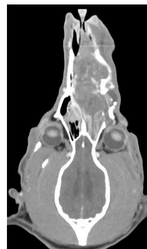
Figure 3 Coronal CT image at the lower zygomatic level revealed the soft tissue mass extended from the cranial nasal passage through the caudal sinonasal area. The mass invaded into the left retrobulbar area.

An increase of radio-opacity at the nasal cavity of canine patients could be caused by several factors, one of which is the nasal tumor. Nasal tumor is counting for 1-2% of tumor found in the dog (MacEwen et al., 1977). The mass could occupy in the hemi-lateral of the nasal cavity or invade into the adjacent organs such as contralateral nasal passage, frontal sinus, intracranial cavity and/or retrobulbar area that were seen in this patient. However, evaluation of the lesion details and invasion of adjacent organ for clinical staging and treatment planning by skull radiograph alone is not an ideal procedure due to the numerous superimposition bony structures. To date, CT reveals as a superior imaging modality for diseases of head and neck by displaying multiplanar reconstruction images of the interested organ that could be overcome with the disadvantage of 2-dimensional conventional radiographs (Ghirelli et al., 2013). Besides, CT could increase a diagnostic sensitivity of gray scale images to differentiate clinical lesions, such as small bony lesions, by adjustable window width and window level. Therefore, for hiding lesions on the complex structure like head and neck area, applying an advanced imaging as CT could be a superior tool for diagnostic and treatment plans in clinical usage.