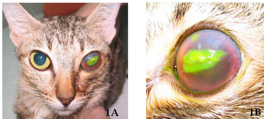
Figure 1. Photograph of Jelly; (A) comparing both eyes and; (B) demonstrating positive fluorescein staining on the cornea and uveitis. (For better quality, figures can be viewed at www.vet.chula.ac.th/~tjvm )

Two weeks after treatment, the IOP was within normal limit. Fluorescein staining was positive (Figure 1).