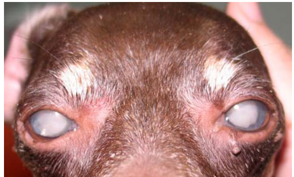
Figure 1 The female Miniature Pinscher presented with white eyes.

The dog had had diabetic mellitus and been treated for over two years. Fasting blood glucose (FBG) at the first visit was 464 mg%, while it had been ranged 200-350 mg% during the past 2 years. Intraocular pressures measured from both eyes every visits were, for the whole time, below 10 mmHg.