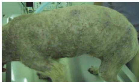
Figure 2 Generalized pustules, erythema, epidermal collarettes, and alopecia of the patient were noted pre-treatment.