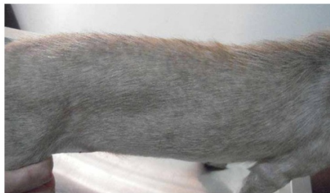
Figure 3 Full recovery was achieved after five-week treatment.

In addition to apitoxin aquapuncture, traditional herbal formulas including Huang Lian Jie Du Tang (0.1 g/kg bw), Shi Wei Bai Du Tang (0.1 g/kg bw), and Wu Wei Xiao Du Yin (0.1 g/kg bw) (KODA Pharmaceutical Co., Taiwan) were simultaneously orally administered twice a day for 5 weeks.