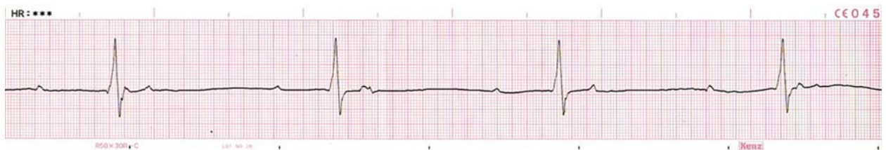
Paper speed 50 mm/sec

These lead II ECG strips were recorded from a twelve years old male uncastrated mixed breed dog weighing 16.1 kg. He was referred to the Small Animal Teaching Hospital, Chulalongkorn University with a history of exercise intolerance and dysuria. He was diagnosed from the local veterinarian to have prostate gland enlargement and urethral calculi from radiography. From physical examination, the dog had mild depression with increased lung sound. Mild abdominal clamp was found during palpation. The abdominal radiography showed multiple small cystic calculi with normal size prostate gland. The thoracic radiograph showed left heart enlargement with mild