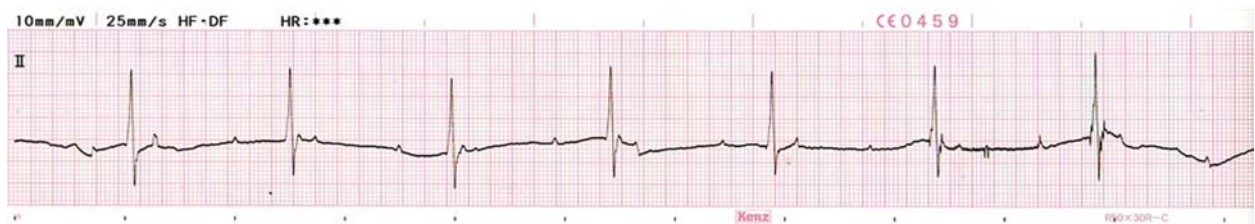
Paper speed 25 mm/sec

Chollada Buranakarl 1 Monkon Trisiriroj 2 Thanusorn Phakhawambodee 2