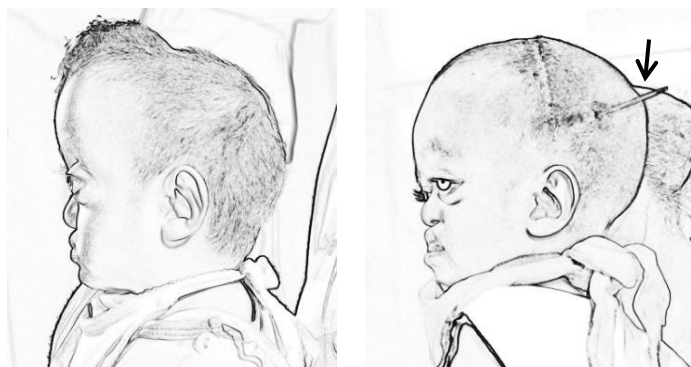
Figure 1 Pre- and post-craniosynostosis surgery with distraction device (arrow pointed) (An original artwork of this research)

The objective of treating children with craniosynostosis is to restore their body to normal state or as much as possible. The craniosynostosis surgery is to open the prematurely fused suture, reduce pressure in the brain skull, correct misshapen head and allow for normal brain growth [5, 6]. At the PSC Center, the surgery of deformities of children with craniosynostosis are undertaken at approximately 6 months to 3 years, earlier if there is evidence of increased intracranial pressure. The insert of a distractor to expand the bones of the skull is to enhance the stability of bones building. Post-surgery children have to be hospitalized for 1-2 weeks and discharged home for further care for 12-14 weeks [7]. Therefore, the ability of caregivers at home is an important factor to the success treatment outcomes and the least possibility of complication.