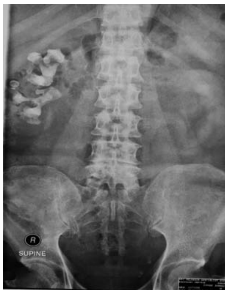
Figure 3: KUB x-ray showing large right renal staghorn calculi