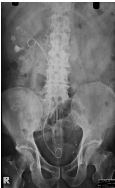
Figure 6: A repeat KUB x-ray following removal of nephrostomy tube

The procedure went well and he was discharged from the hospital with no immediate complications. He was well until about 1 month later when he started having gradual right eye blurring of vision that rapidly progressed and hence brought him to our clinic 4 months later.