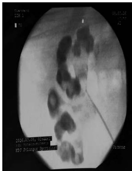
Figure 4: Fluoroscopy-guided PCNL