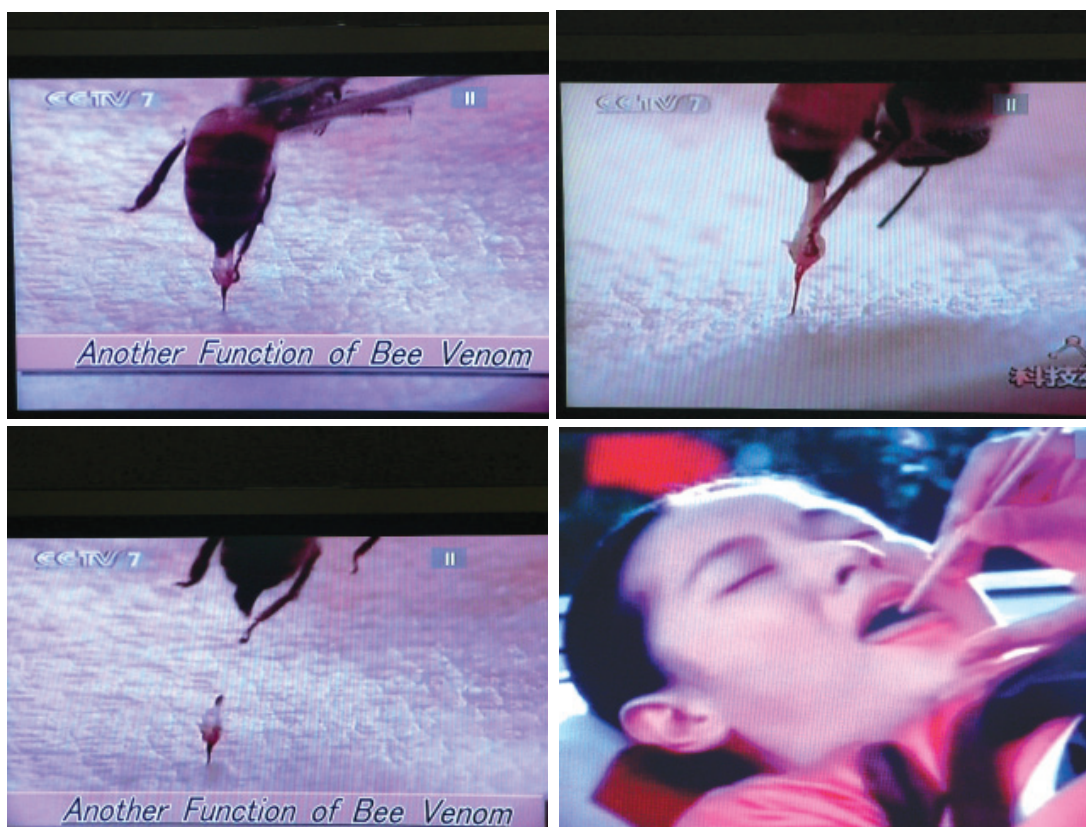
Fig. 1 Bee acupuncture using a live bee.

When treating facial paralysis, cerebral embolism, cerebral thrombosis, bronchial asthma, migraine, hypertension, and thromboangiitis obliterans, it is better to do scattered needlings 1-2 mm apart, 1-2 times a week. In combining bee acupuncture with Apitherapy activilin (Figs. 2 & 3), the number of bees