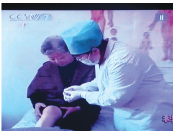
Fig. 2 Bee acupuncture