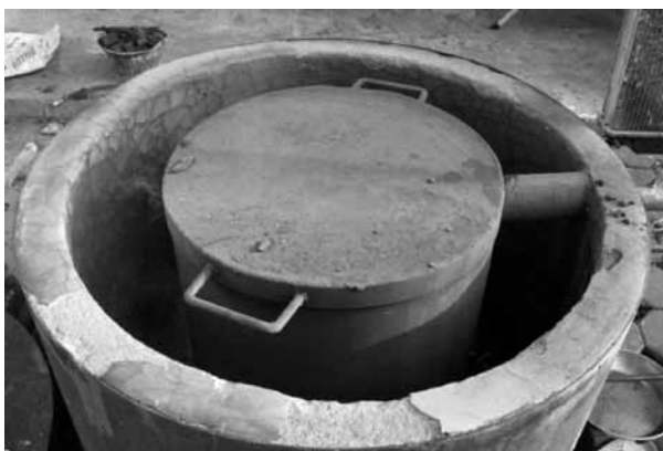
Fig. 4. Inside of the oven