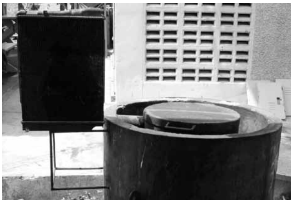
Fig. 3. The air cooled condenser