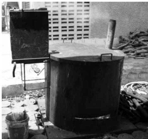
Fig. 5. Operation testing

9. Leave the raw wood vinegar for 3 months to become silted. Remove the tar and light oil, as well as the dark brown translucent oil and the remainder will be sour vinegar.