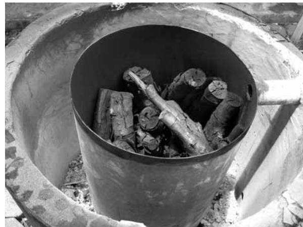
Fig. 6. The obtained charcoal

The average interval of the measured temperature at the pyrolyzing chamber while happening the pyrolysis process is about 300-450°C that meets the desired temperature.