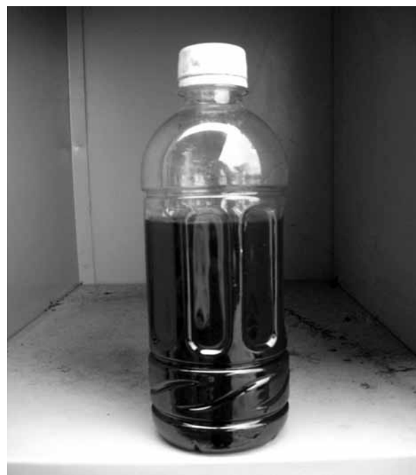
Fig. 7. The obtained raw wood vinegar

Results from study the influence of kind and weight of pyrolyzing wood chips on the yield percent of wood vinegar collected, with 3 replicates. In each experiment uses 20 kg of charcoal residuals as fuel. The experiment results are shown in Table I.