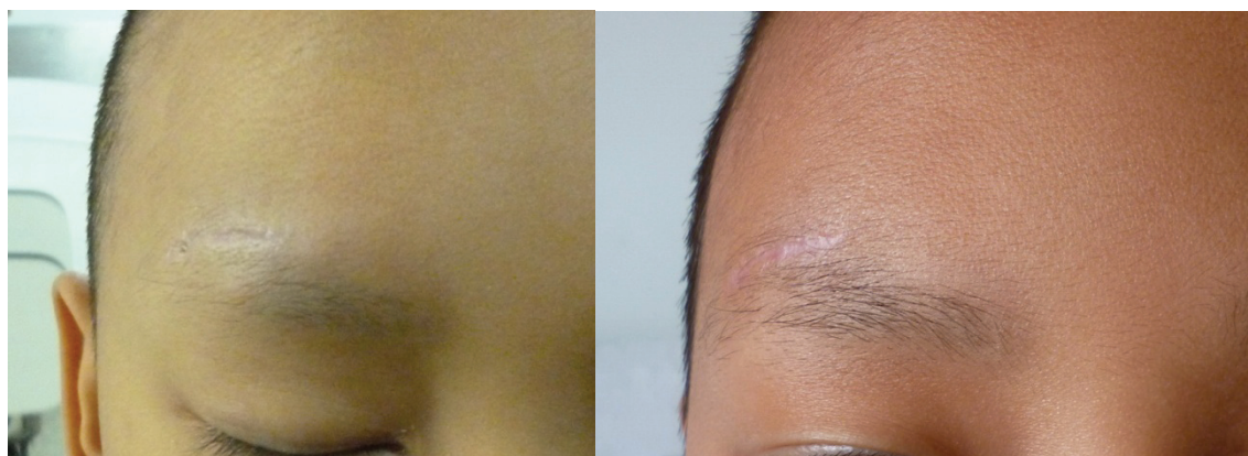
Figure 1. A (left): Subcutaneous mass under the right eyebrow with overlying excisional scar from a biopsy. B (right): After 6-weeks treatment.

Entomophthoramycosis in immunocompetent and immunocompromised hosts is reported as a rare disease worldwide, including Thailand [5-13]. It is caused by fungal infection in the order of Mucormycotina and Entomophthoromycotina [2]. Entomophthorales, which occur predominantly in immunocompetent patients,