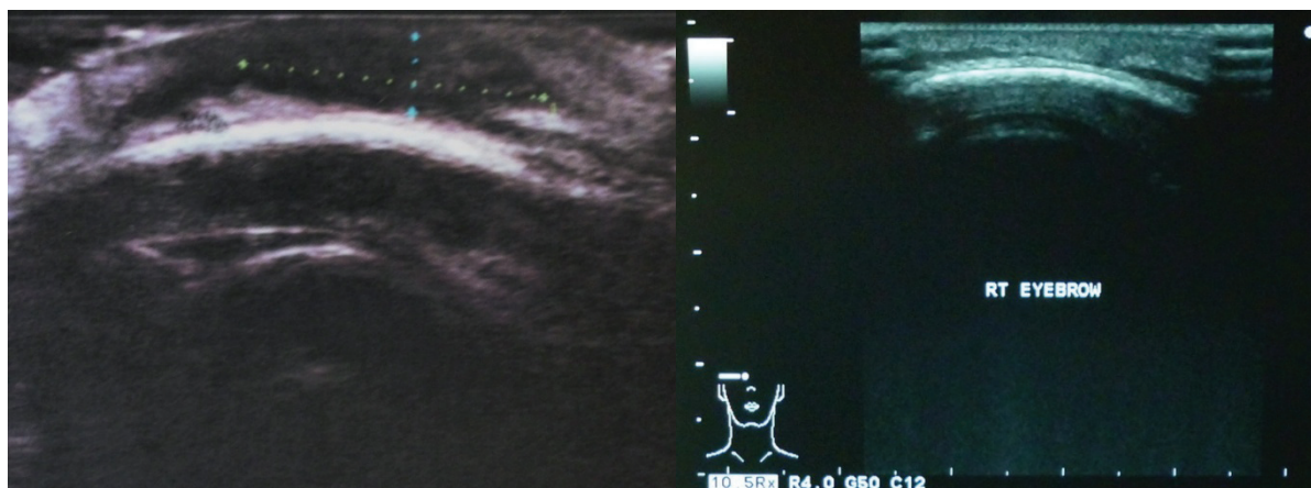
Figure 2. A (left): Subcutaneous heterogeneous echoic mass, 12.2 x 17.7 x 4.4 mm., B (right): After 6-weeks treatment, no evidence of a subcutaneous echoic mass.