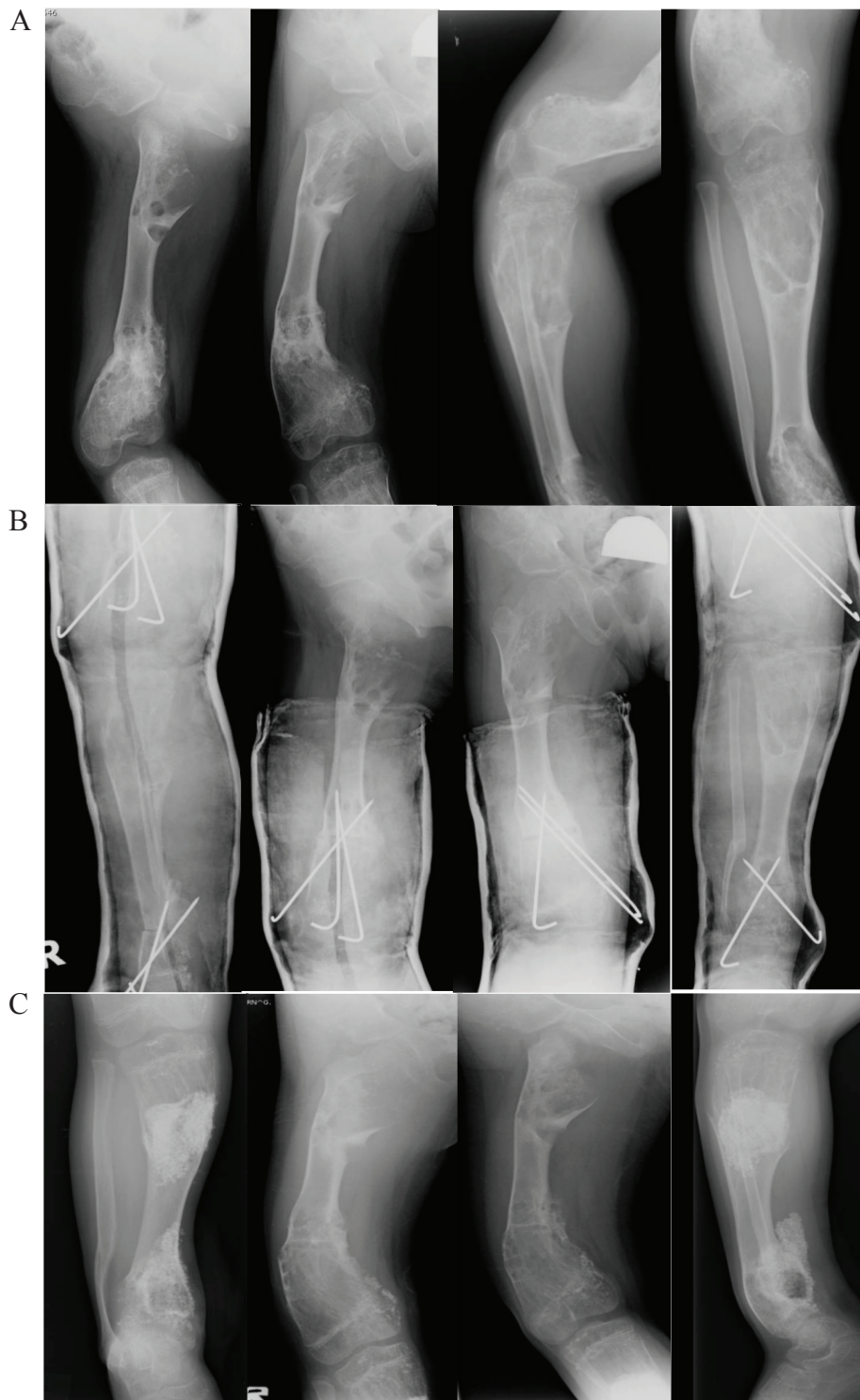
Figure 3. A 9-year-old girl in A , Pre-operative radiograph showed multiple radiolucent, oval-shape lesions at metaphysis extended to diaphysis of right proximal and distal femur and tibia. B , Post-operative Corrective Osteotomy right distal femur and tibia and fibula with nails and long leg cast. C , At the 3-year follow-up time.