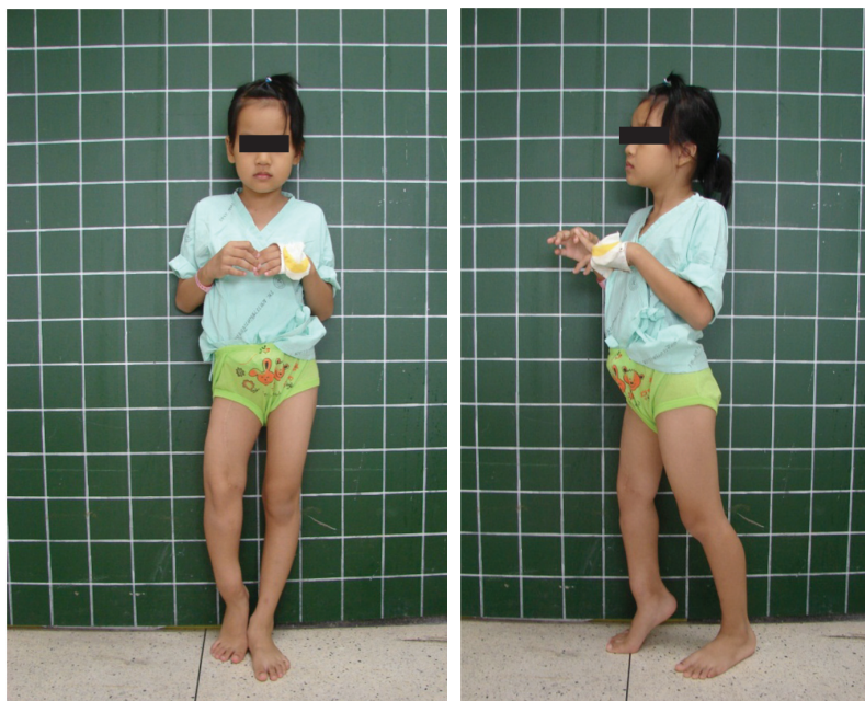
Figure 1. A 9-year-old girl presented with gait abnormality since she was 9 months. The physical examination showed right genu varum with limb-length discrepancy of right femur and tibia.

The importance of Ollier disease is that there can be malignant transformation, which frequently develop into chondrosarcoma; a malignant hyaline-cartilage-forming tumor with no marker can indicate, about 25-30 percent of Ollier patients [1,9,10,13], and some develop into osteosarcoma [10,14]. There are non-skeletal malignant lesions those are gliomas [2,13] and juvenile granulosa cell tumors [2]. Patients are likely to die from non-skeletal tumor, so the examination of the other organs that have a predilection to malignant degeneration is very important for orthopaedic surgeons to get early diagnosis and give them the proper management.