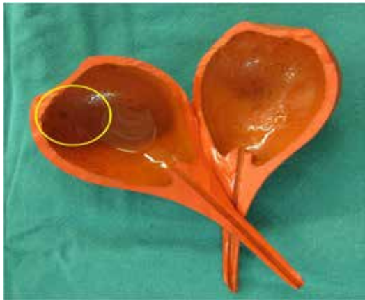
Figure 2 demonstrated internal surface with abnormal dot and some water inside the bulb syringe.