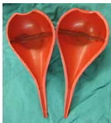
Figure 1c demonstrated a two-piece bulb which the bulb of the bulb syringe has two pieces connected with glue. This type of bulb syringe has no connector to the tube so it has smooth surface at the neck.