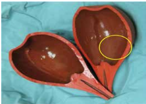
Figure 3 demonstrated slough and contamination dot.