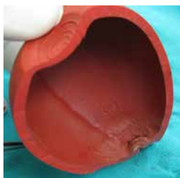
Figure 1b Every one-piece bulb has rough surface at the connection.