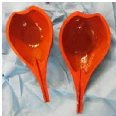
Figure 1a demonstrated an one-piece bulb which the bulb of the syringe has one piece. The bulb is connect to the tube with connector.

Bulb syringes were found in two types: one-piece bulb (Figure 1a, 1b) and two-piece bulb (Figure 1c). Thirty-two samples (60%) were one-piece type. Suction and recoil properties of all samples were intact.